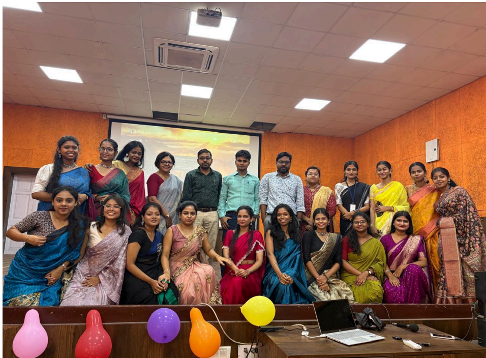
Faculty of the Department of Geography with students in the Campus Hall in 2025.

The department of Geography of Sivanath Sastri College was established in the year 1961. It offers Honours and Multidisciplinary courses that seek to inculcate a holistic understanding of the complex relationships between the physical and cultural landscapes, foregrounding the linkages between man and environment in modern contexts. Keeping in view the current technological advancements, students are provided with hands-on guidance for conducting GIS and remote sensing and different geographical instruments. This guidance prepares the students for a number of academic and professional opportunities. Furthermore, field excursions provide real-time experience to students to enable them to analyze practical applications related to their curriculum. With the introduction of 4-year Honours B.A./B.Sc. Course with Research in Geography, field excursions have become an integral part of the holistic learning process in the final Semester of their Course. On account of the efficient methodologies adopted by the Department for conducting the Courses, students have consistently performed well in their university examinations and have gone on to join various national and international universities for their further studies and employment.