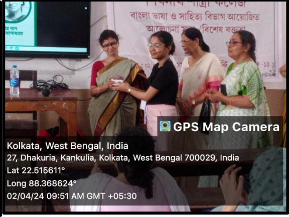
GPS Map Camera Kolkata, West Bengal, India 27, Dhakuria, Kankulia, Kolkata, West Bengal 700029, India Lat 22.515611° Long 88.368624° 02/04/24 09:51 AM GMT +05:30