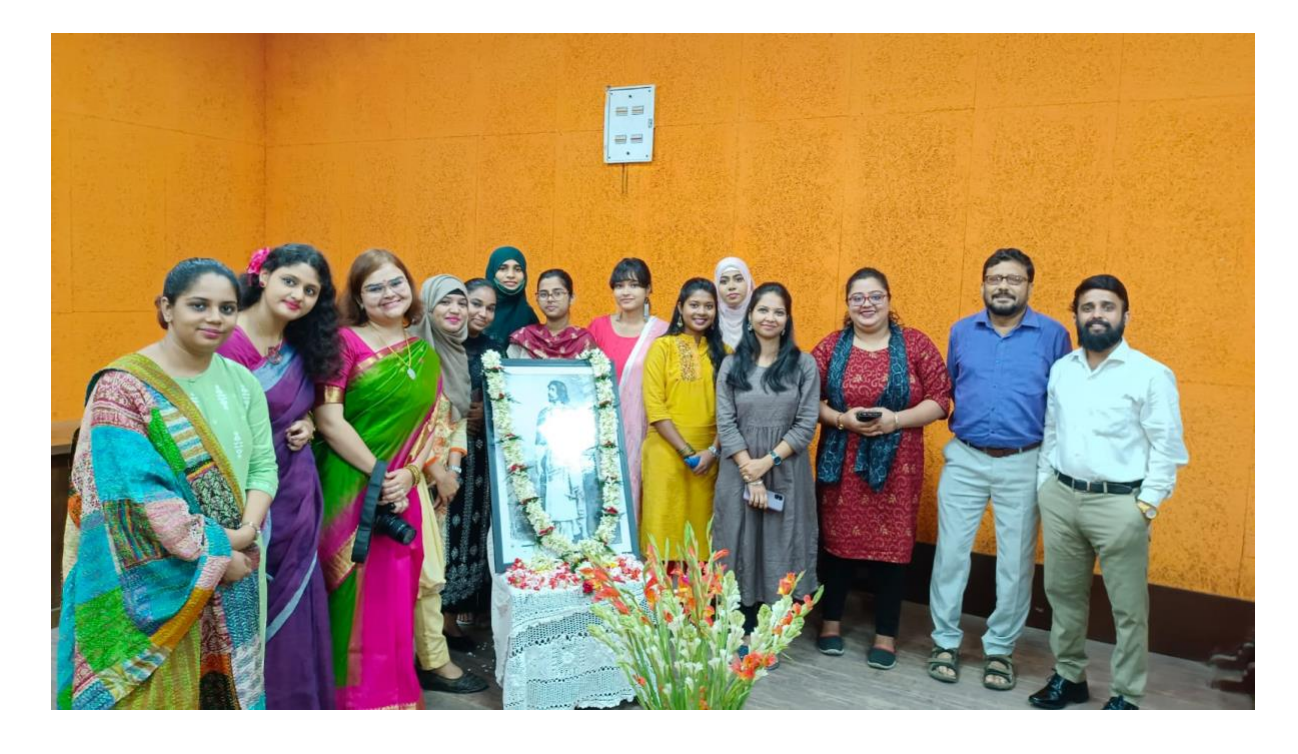
Taking Part in Student Seminars

A sizable section of the students take part in different cultural programmes commemorating Independence Day, Women's Day programmes and various other programmes organized by the Cultural Committee.