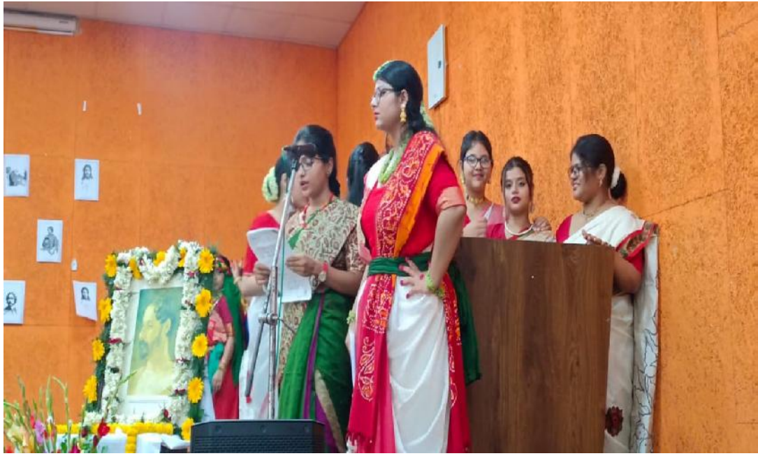
Our students participated in cultural programmes