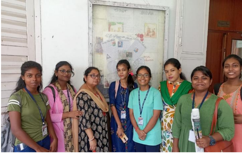
Departmental Wall magazine published on 2022.