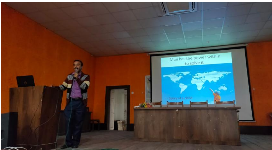
Our students attended invited lectures