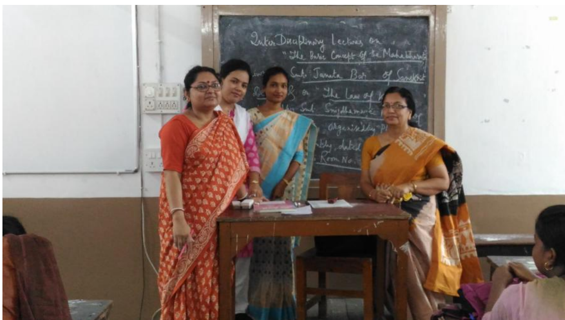
Interdisciplinary lectures in the Department of Sanskrit and Philosophy.