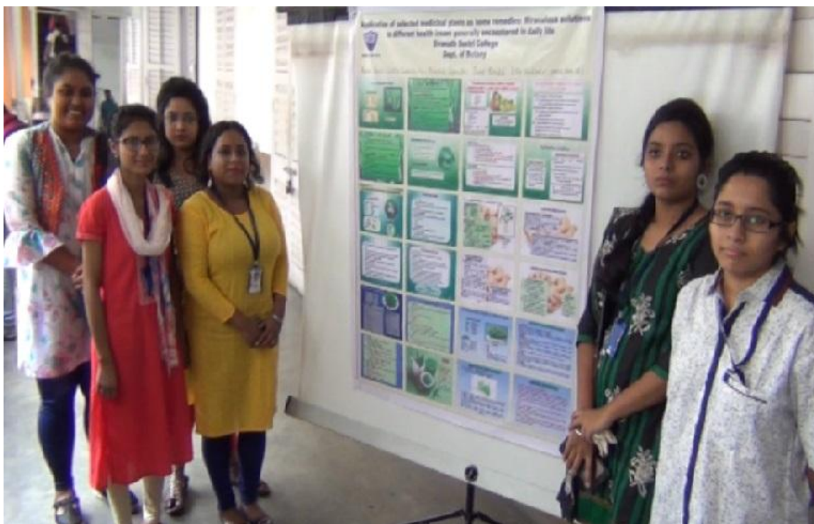
Participants of One day Interdisciplinary seminar & workshop on “Revolutionary journey of Medicinal Plants from Ancient days to Modern civilization”