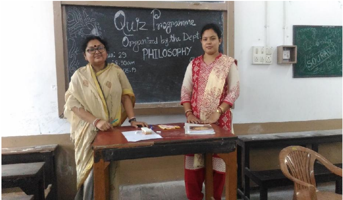
Quiz Programme organized by our Department on 5/5/2019.