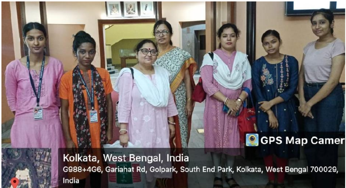
Educational visit to 'Art and Gallery Museum' in Ramkrishna Mission, organised by Department of Philosophy & Sanskrit.