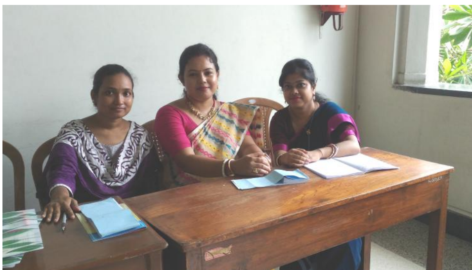
Registration Desk at One Day Seminar on Sister Nivedita and Revitalization of Indian Culture